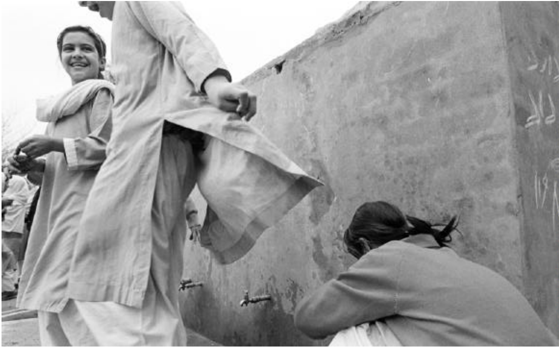
Girls at a school set up for orphaned children by Revolutionary Association of Women of Afghanistan (RAWA). Peshawar, Pakistan. February, 2002.