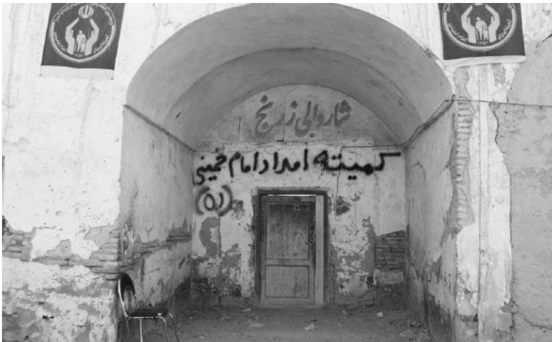
Headquarters of Komite-ye Emdad-e Imam Khomeini (Imam Khomeini's Aid Committee, funded by Iranian government). Zaranj. March, 2002.