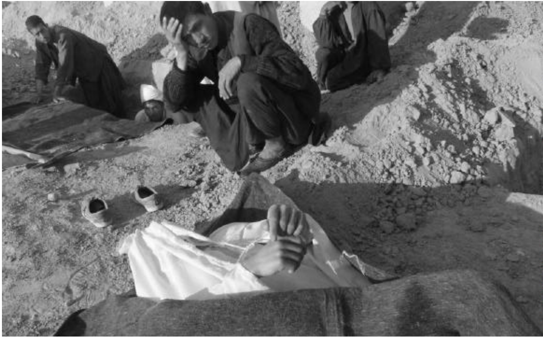
One of the bodies of a group of refugees who were killed, apparently, while attempting to cross the border to Iran. Corpses were found with their hands oddly and "inexplicably" stiffened mid-air. Zaranj. March 17, 2002.