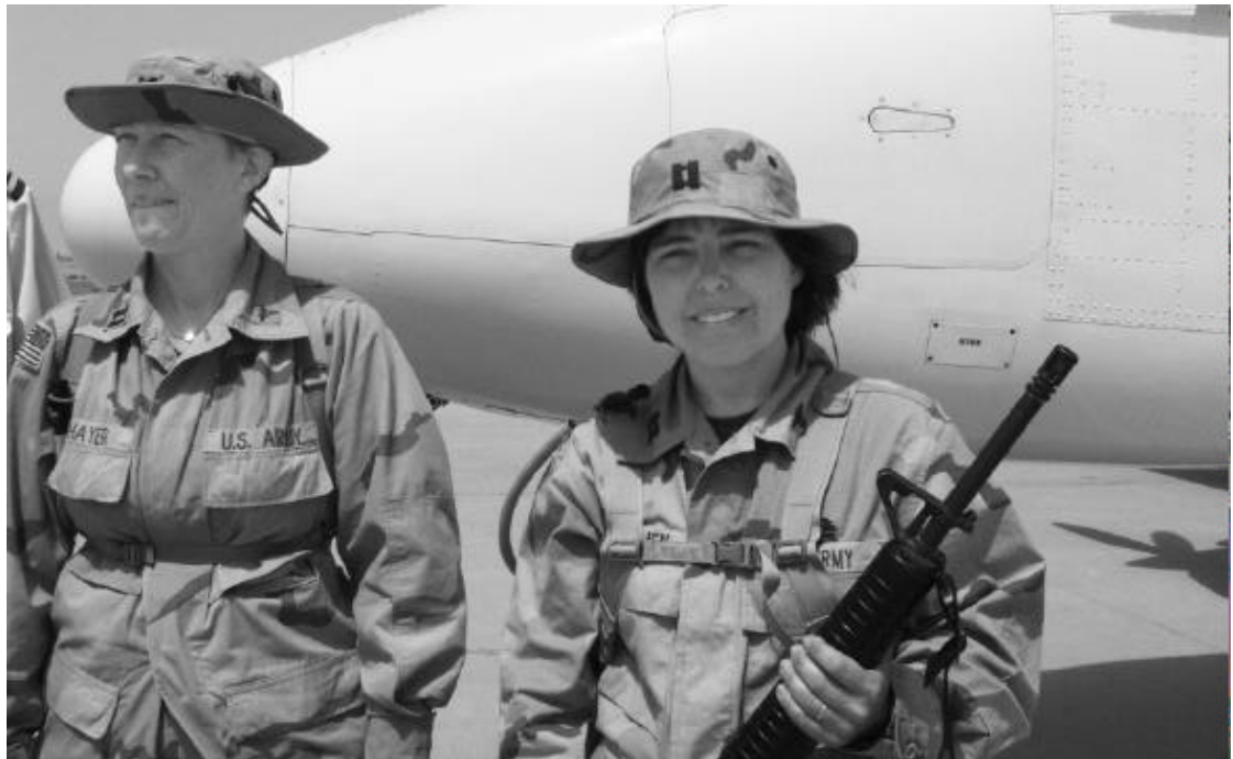
U.S. soldiers. Khandehar Airport. April, 2002.