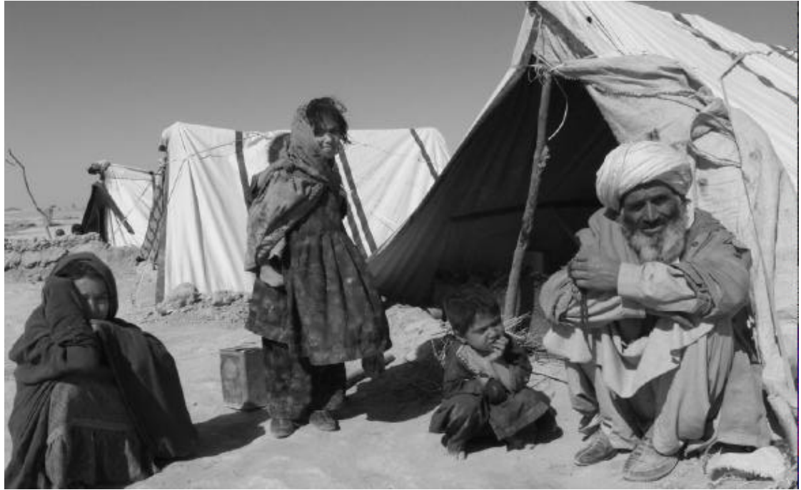
Living conditions in an "IDP" camp. Near Zaranj. March 13, 2002.