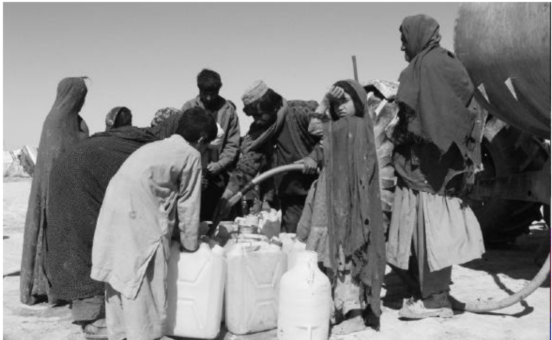
Water delivery by Médecins sans Frontières in an "IDP" camp. Near Zaranj. March 13, 2002..