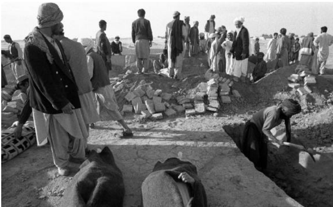
Burial of the group of refugees found "mysteriously" dead near the border to Iran. Zaranj Cemetery. March 17, 2002.