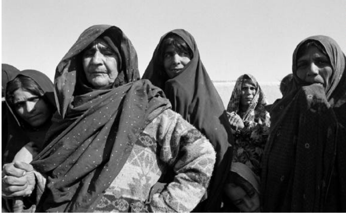
Refugees from an "IDP" camp standing in line at Médecins du Monde's clinic. Refugees trapped inside the borders of their country are labeled "Internally Displaced Persons" by the United Nations. Zaranj, March, 2002.