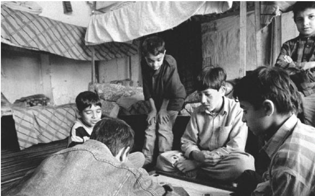
Boy's Dormitory at the school run by RAWA. Peshawar, Pakistan. February, 2002.