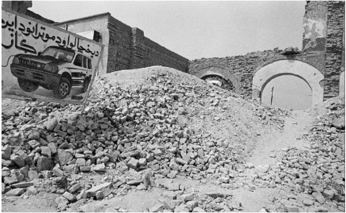
A billboard advertisement. Khandehar. April, 2002.