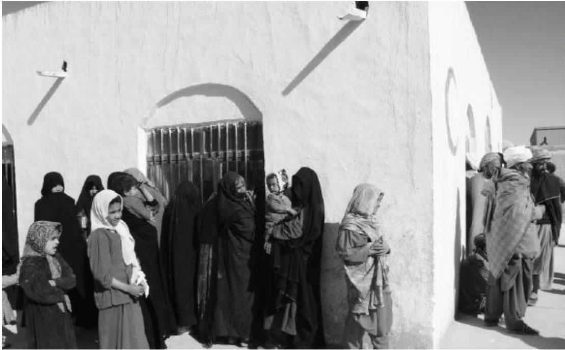
Refugees waiting outside the Médecins du Monde's clinic. Zaranj. March 13, 2002.