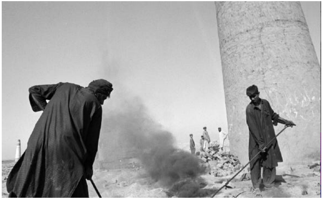
Afghani refugees working at a brick factory (the figure in the foreground is a former high-ranking army officer). Charat Camp. Peshawar, Pakistan. February, 2002.