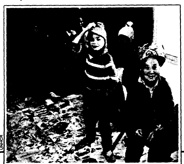
Indochinese refugees in transit centre near Paris

In general, this organization only works for foreigners who have requested the status of political refugee. This rule involves some exceptions, however, in favour of the nationals from the former colony of Indochina.