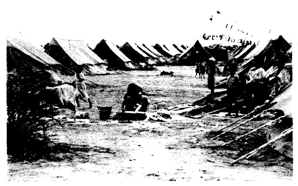
Tug Wajale refugee camp, home for 32,000 Ethiopians in Somalia, 1986.