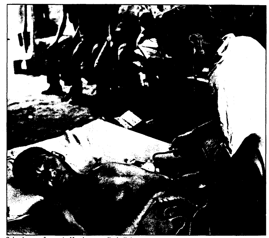
Salvadoran refugees in Honduran medical clinic.

First, what does it mean to be 'allowed to return?' Is protection implied or could that 'safe third country' send the person back to his or her country of origin, which the claimant may have fled because of a 'wellfounded fear of persecution.' This is not