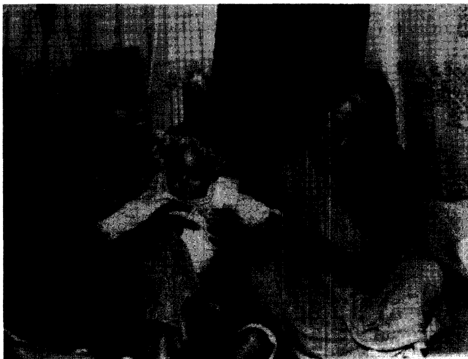
Women refugees in the camp

It is obvious that the UNHCR presence has deterred any forcible repatriation. At the same time it cannot be overlooked that of the 2,938 persons screened by UNHCR only 90 withdrew their applications for repatriation (UNHCR). Thus no general conclusion can be drawn that total repatriation was forced, a number of refugees did go back voluntarily. UNHCR officials now wait in Madras for repatriation to restart but the refugees are not interested in going back. The channels of communication open through their network show a very confused scene in Sri Lanka.