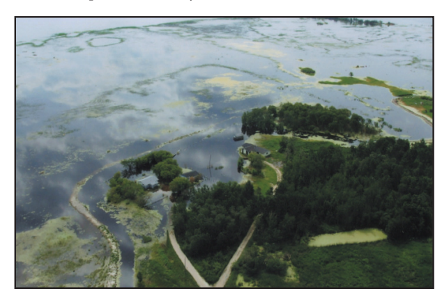
Photo 2. Aerial view of impact of 2011 flood on Lake St. Martin FN