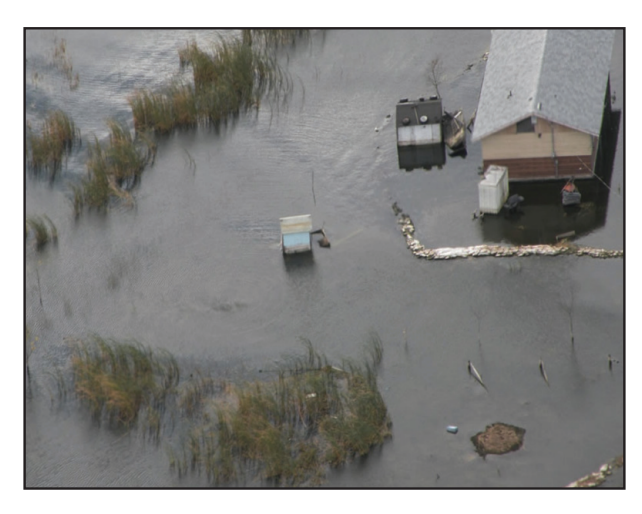
Photo 1. Housing at Lake St. Martin First Nation affected by 2011 flood

The evacuation required people to leave most possessions behind and disperse into different hotels in the Interlake, Winnipeg, and other locations. Without a home, many people resided in hotels, without a kitchen to prepare nutritious food. Without a way to make meals, healthy diets were difficult to maintain.<sup>59</sup> The daily evacuee allowance of twenty-four dollars per adult per diem did not cover the costs of having to eat in restaurants. Families had to make tough choices, deciding each day who would eat and who would not, as the money would not cover three meals a day for all family members. This initial stipend was drastically reduced to four dollars per adult per day, and many people spiralled into debt, taking loans from friends and family. Families were forced to access food banks to supplement their basic needs and often went hungry.