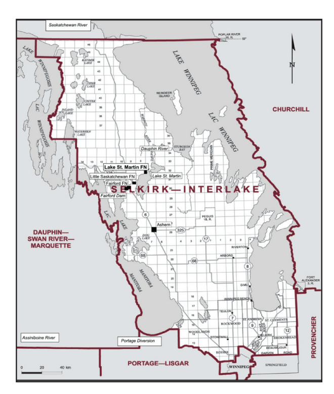
Figure 2. Location of Lake St. Martin First Nation downstream from Lake Manitoba and the Fairford Water-Control Structure

Provincial officials manage risks from floods, and these actions can reduce or worsen impacts. Institutional structures (e.g., rules, customs, and land tenure) and processes (e.g., laws, policies, societal norms, and incentives) operate on multiple scales to change flooding impacts.<sup>29</sup> Institutional structures such as the Indian Act, and other colonial policies that continue to this day, take away local