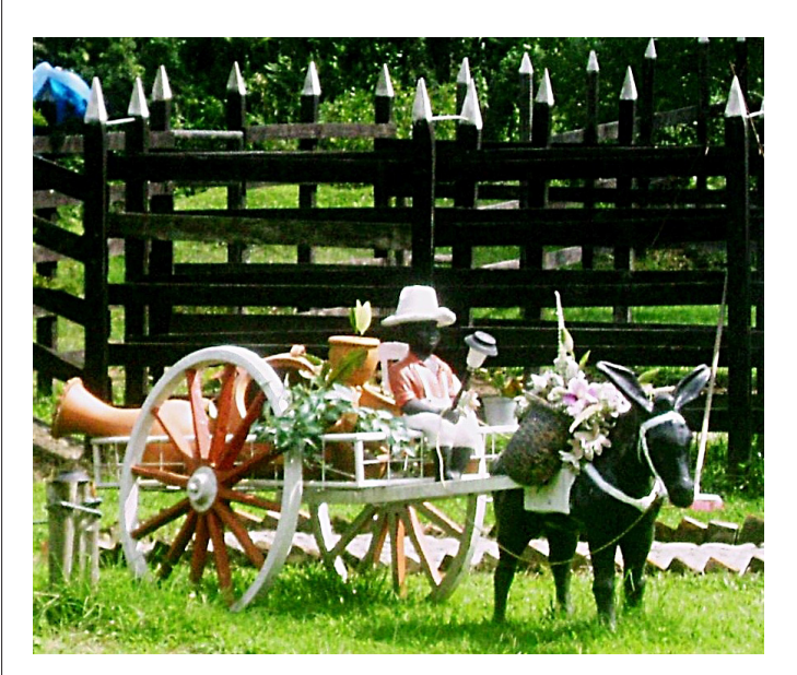
Figures of Afro-descendants reminiscent of the slavery era are a common sight at the entrance of upper-class country houses in the coffee region. These representations portray them as servants from a different era and distant geographies, emphasizing that they do not belong in the coffee region, but in the tropics.

conflict that involves guerrilla groups and the state (armed forces) in collusion with economic interests (multinationals, local economic interests, drug trafficking, and paramilitary groups).<sup>28</sup> This conflict destroys community life, advances genocide in some of these communities and forces their displacement to other areas, particularly to urban centres. Afro-Colombians and Indigenous people have been subjected historically to racism, but for Mestiza campesinas who are displaced from territories where they have lived for generations, the displacement can be understood as a form of racialization that subjectified them to racism.