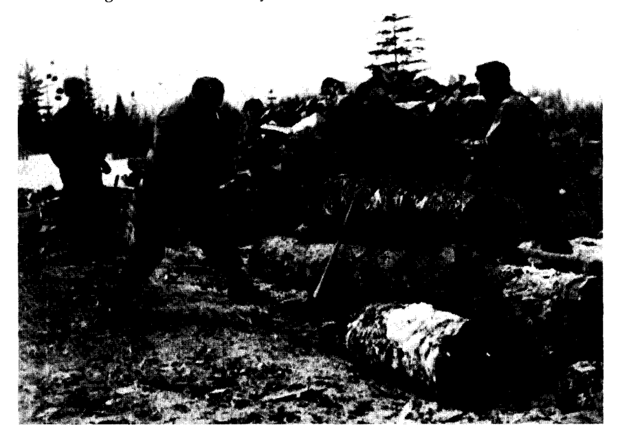
"They were seen as people with brains in a country that wanted people with brawn." Jewish internees chopping wood at Camp B, near Fredericton, New Brunswick.