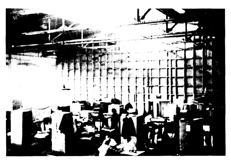
Living quarters, Camp N, Sherbrooke, Quebec. Shot taken with an illegal pinhole camera. (Photo by Marcell Seidler).

* Proceedings of the International Seminar on Refugee Women in Soesterberg, the Netherlands, 22-24 May 1985. (Amsterdam: Dutch Refugee Association, 1985)