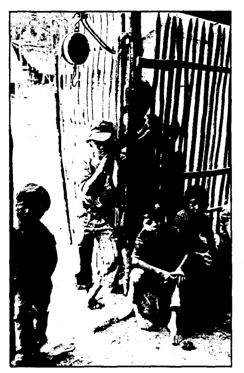
Salvadoran refugee children in Honduran medical clinic.

Canada has won a hard-earned reputation as a nation that is humanitarian in spirit and in practice. But the country's reputation is no more than the sum of its concerned peoples' efforts. There are many incidents in which a particular group of people were saved from persecution and possible death because the Canadian gov-