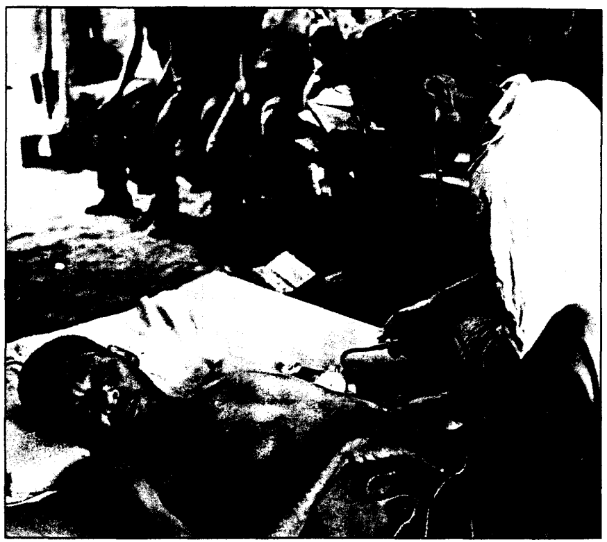
Salvadoran refugees in Honduran medical clinic.

First, what does it mean to be 'allowed to return?' Is protection implied or could that 'safe third country' send the person back to his or her country of origin, which the claimant may have fled because of a 'wellfounded fear of persecution.' This is not